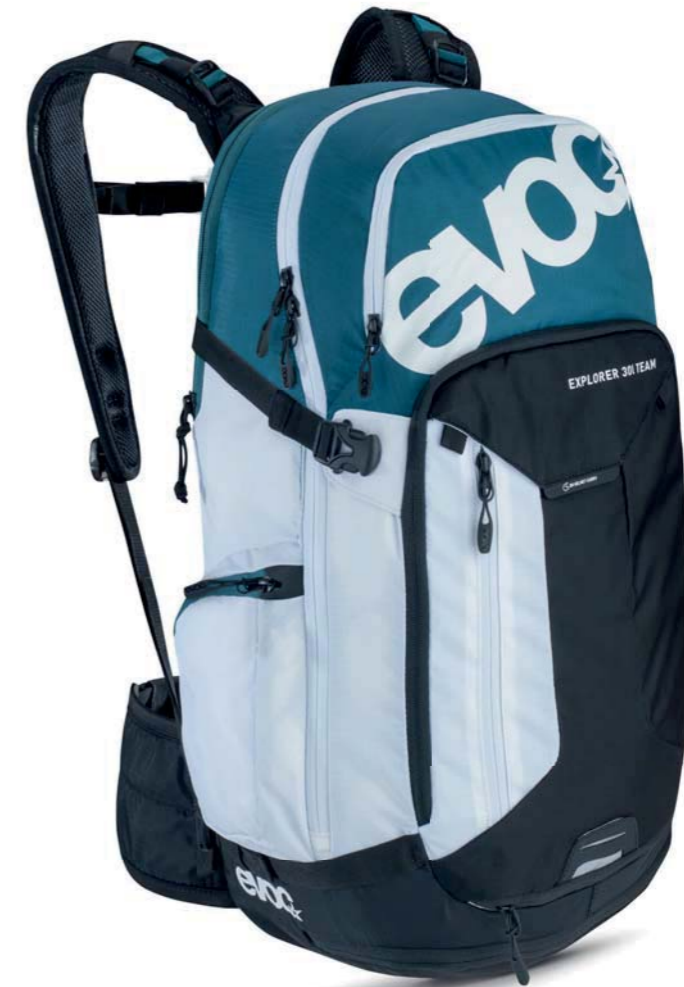
team BLACK - PETROL - WHITE 100201103