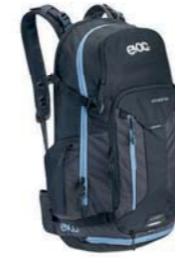
BLACK - MUD 100201102

boost air circulation. During descents you can reduce the distance again, which then ensures that the backpack sits firmly and is completely neutral to movement.