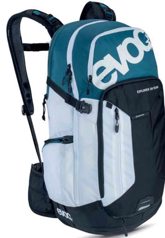
team BLACK - PETROL - WHITE 100201103